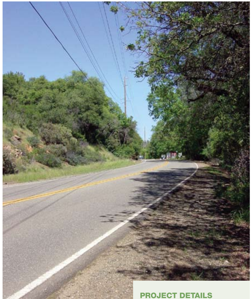
A preconstruction view of EDCDOT's roadway project in Cameron Park, Calif.

Using 3D modeling software, DOTs can visualize a transportation project at any stage in the design process, thus minimizing errors by identifying problems far earlier, when they can be corrected much more easily and at less of an expense. In addition, using a